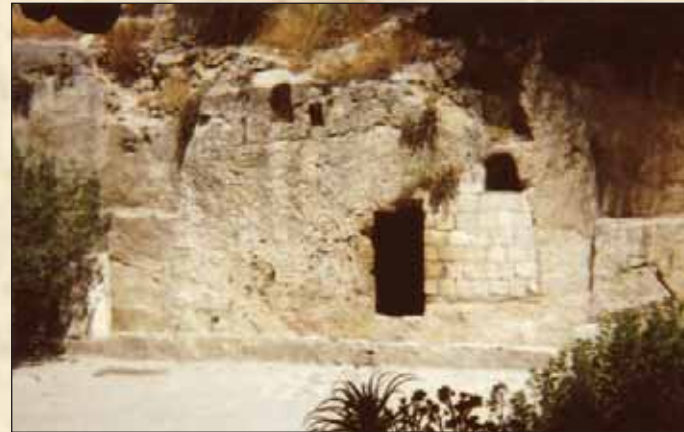
The possible garden tomb where Jesus of Nazareth was laid after his crucifixion.

"The things that happened to Jesus of Nazareth," they answered. "This man was a prophet and was considered by God and by all the people to be powerful in everything he said and did. Our chief priests and rulers handed him over to be sentenced to death, and he was crucified. And we had hoped that he would be the one who was going to set Israel free! Besides all that, this is now the third day since it happened. Some of the women of our group surprised us; they went at dawn to the tomb, but could not find his body. They came back saying they had seen a vision of angels who told them that he is alive. Some of our group went to the tomb and found it exactly as the women had said, but they did not see him." (Luke 24.13-24)