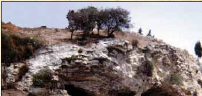
CALVARY: the scene of the recent crucifixions.

As they came near the village to which they were going, Jesus acted as if he were going farther; but they held him back, saying, "Stay with us; the day is almost over and it is getting dark." So he went in to stay with them. He sat down to eat with them, took the bread, and said the blessing; then he broke the bread and gave it to them. Then their eyes were opened and they recognised him, but he disappeared from their sight. They said to each other, "Wasn't it like a fire burning in us when he talked to us on the road and explained the Scriptures to us?"